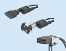
Ion blower nozzles